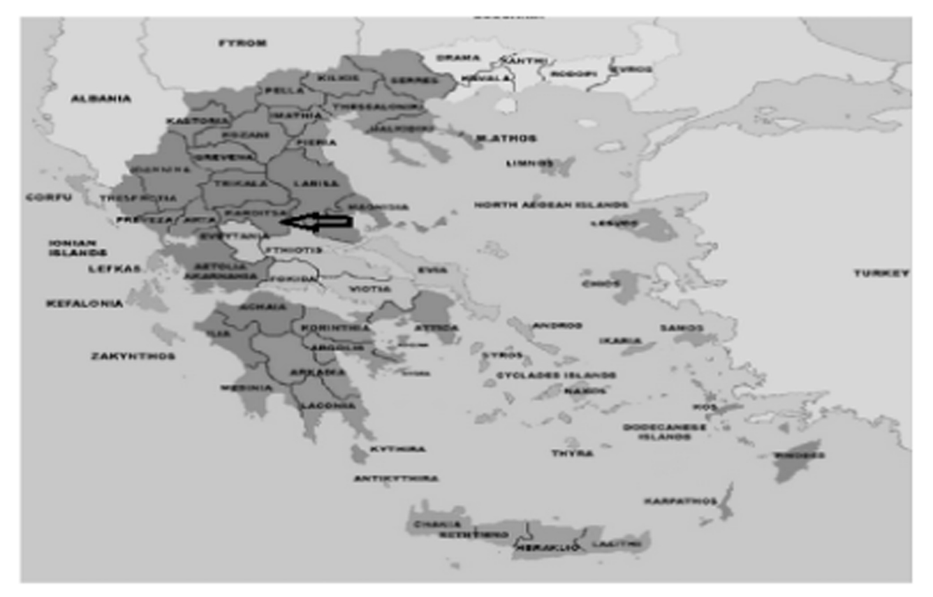
Map 1. Greece: The regional unit of Karditsa.

Break-even budgeting enables us to estimate the minimum energy crop price that would provide incentives to farmers to cultivate. This price is referred to as critical price. Subsequently the critical price is used to estimate the energy crop supply curve, which provides information about the energy crop supply response of farms and the potential impacts on the balance of trade for the competitive conventional crop: