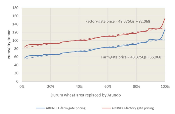
Fig. 3. Supply curves of energy crop for each delivery scenario.

producers [51]. Also of major importance for all decision makers along the biofuel supply chain, including regional and national policy makers are non-economic factors such as new technologies and methods for biomass production and harvesting, the level of environmental awareness of the rural population that can be enhanced by proper environ-